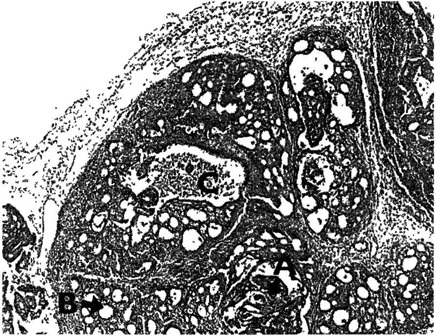
Figure 1. Ductal carcinoma, A: papillary, B: cribriform, and C: comedo pattern. Haematoxylin – eosin. Magnification 40 \times

metastases were observed in other organs of MNU treated animals. Metastases are reported when study processed over two or three years (Russo et al. 1990).