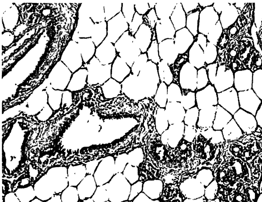
Figure 2. Normal adult mammary gland of virgin female rat – control group Haematoxylin – eosin. Magnification. 40 \times .

son et al. 1969; Cave et al. 1979; Rose and Mountjoy 1983) on development and growth of these neoplasms. Milmore et al. (1982) have reported that mild propylthiouracil treatment of rats previously treated with MNU results in enhancement of mammary tumour development. In other studies, hypothyroidism failed to influence mammary tumour development in rats previously treated with MNU (Cave et al. 1977; Rose and Mountjoy 1983). Within the past few years, several studies have provided convincing data showing that lactation is accompanied by a characteristic euthyroid sick-like syndrome, characterized by decreased concentration of circulating iodothyronines and increased concentration of thyroid-stimulating hormone (TSH) (Fukada et al. 1980). It has also been shown that human breast cancer could be accompanied by a variety of thyroid disorders (Rasmusson et al 1987; Giani et al. 1996; Limanova et al. 1998). On the other hand, reduction or even a complete lack of 5'-DI was confirmed in human thyroid, kidney or prostate carcinomas (Schreck et al. 1994; Köhrle 1997; Köhrle 2000). Tissue-specific activation or inactivation of ligands of thyroid hormone nuclear receptors, belonging to the steroid retinoid-thyroid hormone superfamily of transcription factors (Glass and Holloway 1990; Rollerova et al. 2000; Zhang and Lazar 2000), represents an